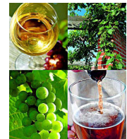
ABC Package Atlanta Hwy

PINEY CREEK PLANTATION Dawson, Georgia "Hunt in The Old Southern Tradition" 2007 Host Property for the 21st annual QUAIL UNLIMITED CHEVROLET Celebrity Quail Hunt 229-317-3624 allen@pineycreekplantation.com